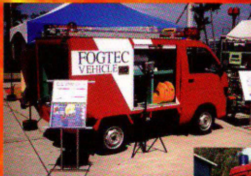
Rapid intervention vehicle