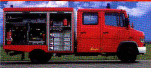
Standard fire truck

Wall hydrants • In production units • In laboratory areas • In offices