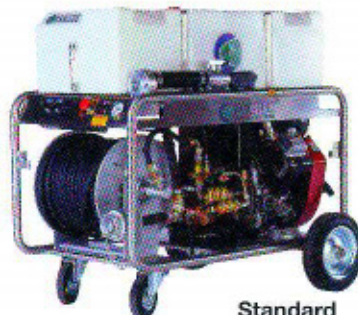
Standard high pressure unit

FOGTEC high pressure units are available as standard devices with petrol or electric engine or for operation via an auxiliary drive unit. They have been developed in conjunction with specialist fire brigade personnel and as a result are particularly easy to use and robust. In addition to skid mounted units designed for inclusion into fire fighting vehicles, compact devices with integral hose reel and water tank are available as independent working systems. Appropriate additives such as AFFF can be used either as a pre-mix solution or by injection. A wide range of formats and options are available and it is possible, for example, to operate two FOGGUNS from a special high pressure unit, which demonstrates the flexibility of the system.