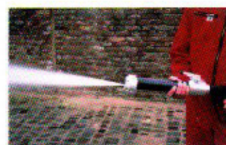
Coarse water mist