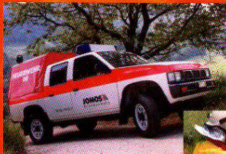
Pick-up truck as extinguishing vehicle