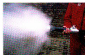
Water mist, medium range