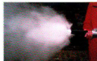
Fine water mist