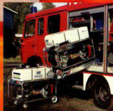
Skid mounted standard unit