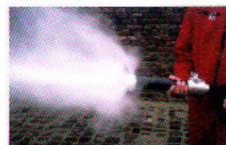
Water mist, long range